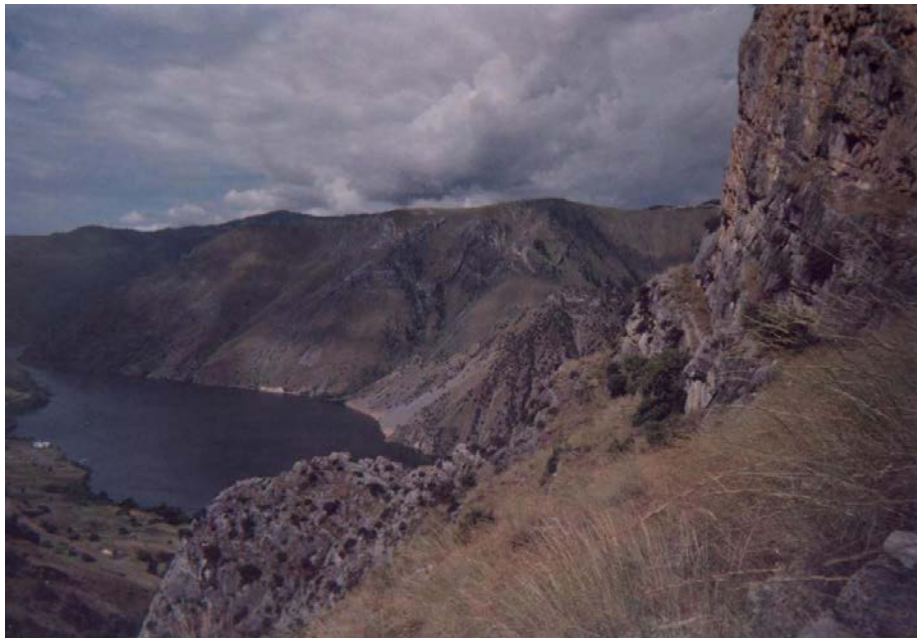
The hike up the canyon