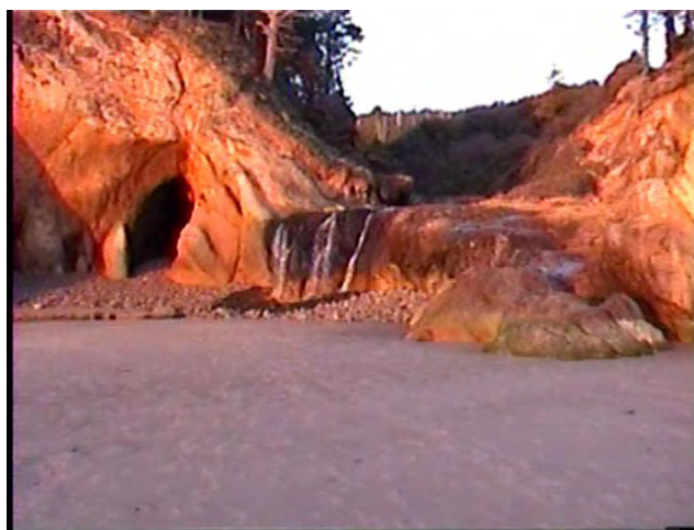
Hug Point Sea Cave.