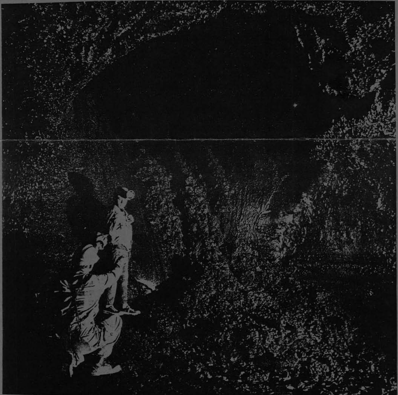
A lava falls in Dynamited Cave